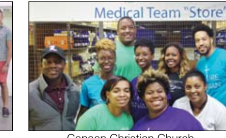
Canaan Christian Church